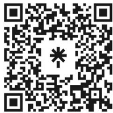
Scan here for one time giving, link to our website, for upcoming events or subscribe to our weekly e-news.