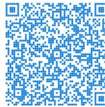
Venmo to: @give2tmpc This will be treated like a cash donation unless we can easily match your venmo name with a name in our donation database.